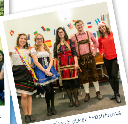
Learn about other traditions and cultures