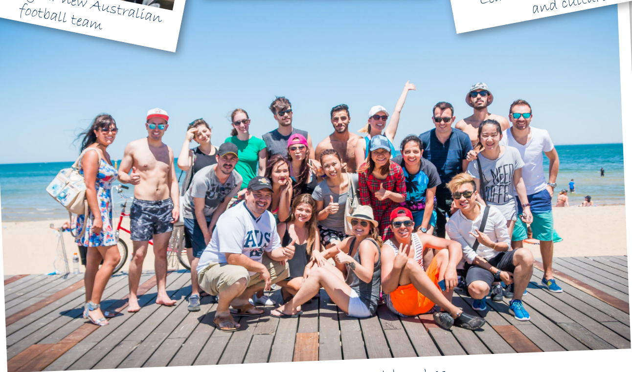
Swim and play volleyball at local beaches