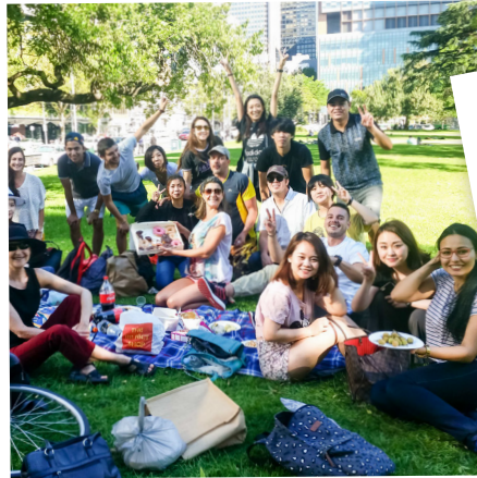
Have a picnic with new friends