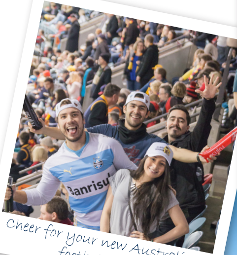
Cheer for your new Australian football team