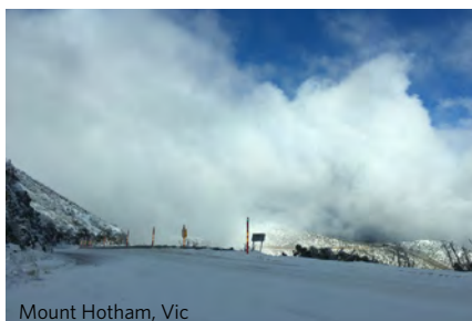
Mount Hotham, Vic