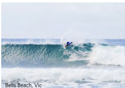
Bells Beach, Vic