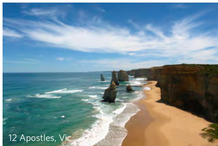
12 Apostles, Vic