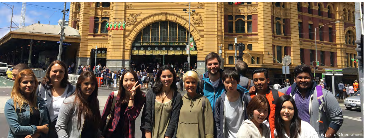
as part of Orientation