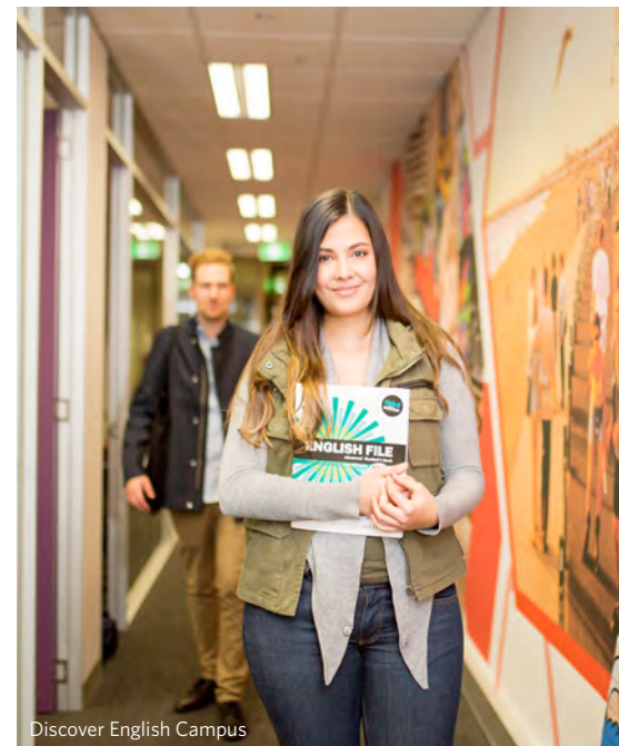
Discover English Campus