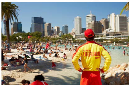
Picturesque views, white sandy beaches, tropical rainforests, and extensive bushwalking opportunities are all nearby.

Many of these events take place in the wealth of public spaces in and around the city, which make for excellent study break locations.