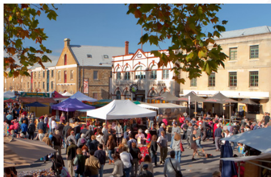
The Salamanca Markets are a hub of the thriving cultural and artistic movements that make Hobart feel so unique.

With a considerable focus on hospitality and food culture, this campus is ideal for those studying in our commercial cookery and hospitality courses.